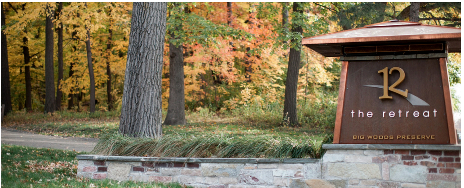
The Retreat, Minnesota